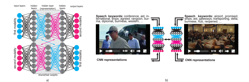
Figure 3: a) BiDNN architecture [8]: training is performed crossmodally and in both directions; a shared representation is created by tying the weights (sharing the variables) and enforcing symmetry in the central part b) video hyperlinking with BiDNNs [10]: both modalities (aggregated CNN embeddings and aggregated speech embeddings) are used used in a crossmodal translation by BiDNNs to form a multimodal embedding. The same is done for both the anchor and the target video segments. The newly obtained embeddings are then used to obtain a similarity score.

acts as a common multimodal representation space that is attainable from either one of the modalities and from which we can attain either one of the modalities.